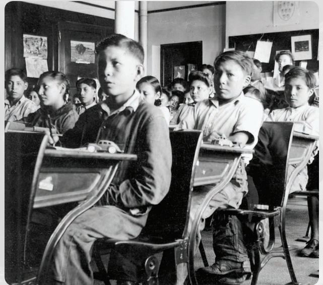
Residential School Classroom.

The goal of Choose Your Voice is to empower students to help build a more inclusive Canada.